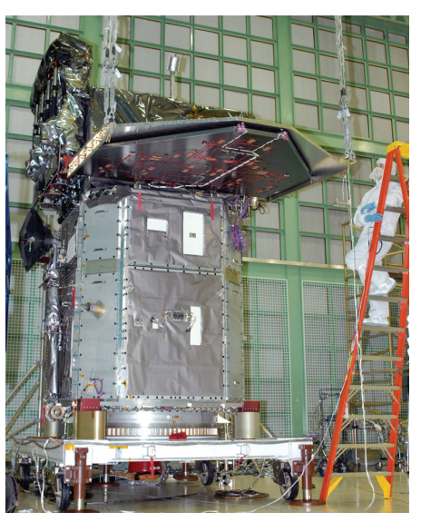
SDO being assembled in the clean room at Goddard

The Extreme Ultraviolet Variability Experiment (EVE) will measure the sun's ultraviolet brightness. The sun's extreme ultraviolet output constantly changes. Slow variations in ultraviolet flux affect Earth's atmosphere and climate. Rapid changes in ultraviolet radiation can cause outages in radio communications and affect satellites orbiting Earth. EVE will take measurements of the sun's brightness as often as every ten seconds, providing space weather forecasters with warnings of communications and navigation outages.